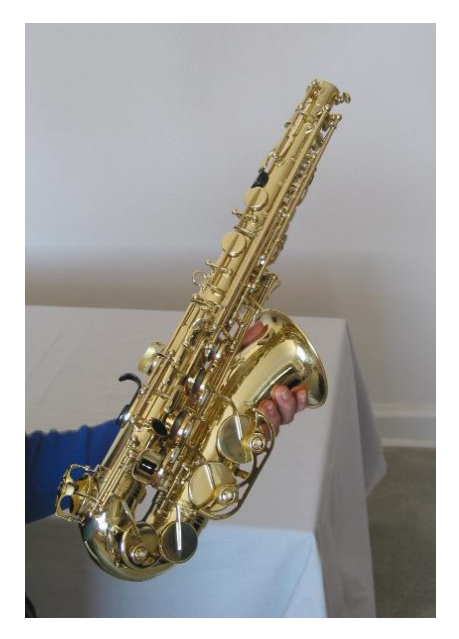
The bell is a good solid place to hold the saxophone when you are not playing it and when you are taking it out or putting it back into its case.