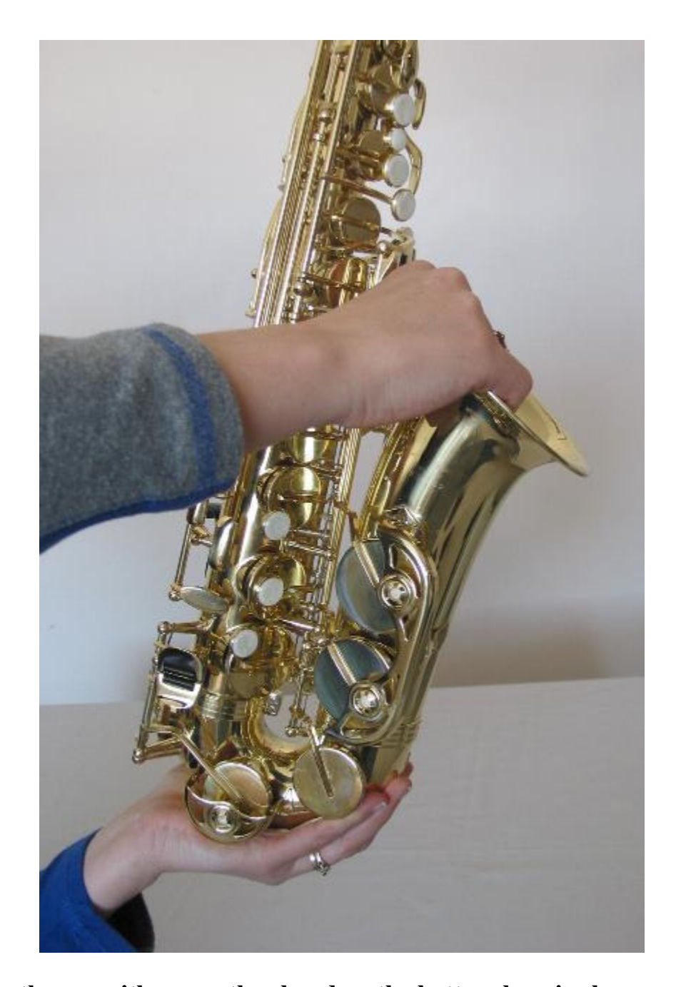
Holding the sax with your other hand on the bottom bow is also a good idea.